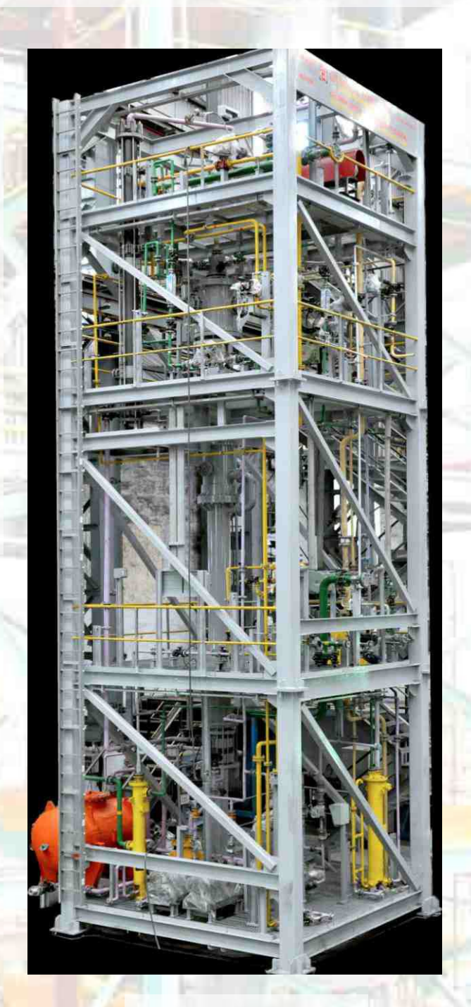
Skid mounted unit